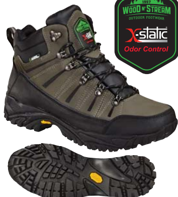
Vibram® Skeleton Trek