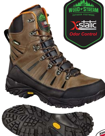
Vibram® Skeleton Trek