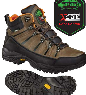
Vibram® Skeleton Trek