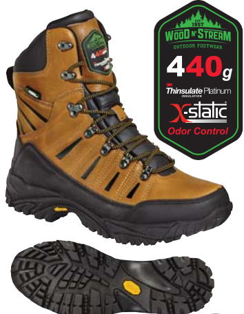
Vibram® Skeleton Trek